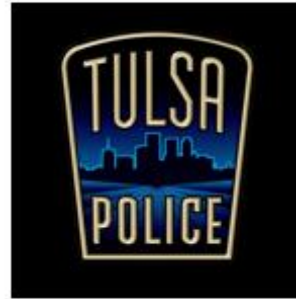
COPES Embedded TPD