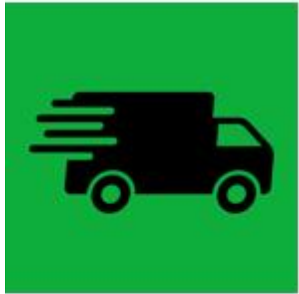
COPES and 988 Mobile Response