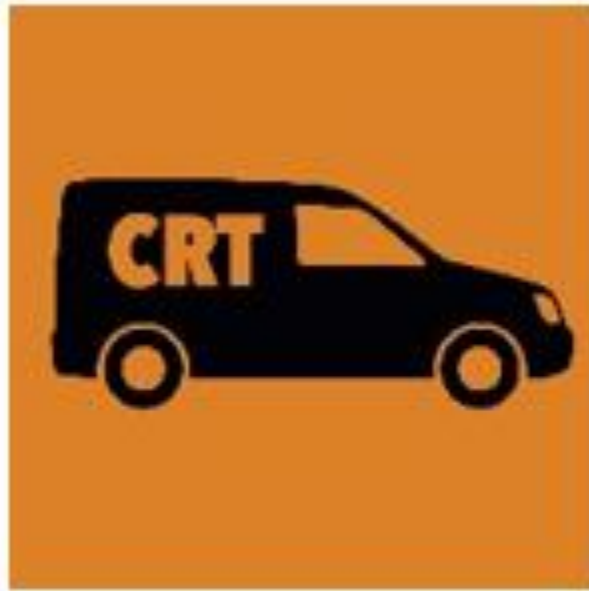
Community Response Team (Mobile)