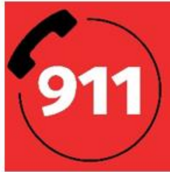
COPES Embedded in Tulsa 911