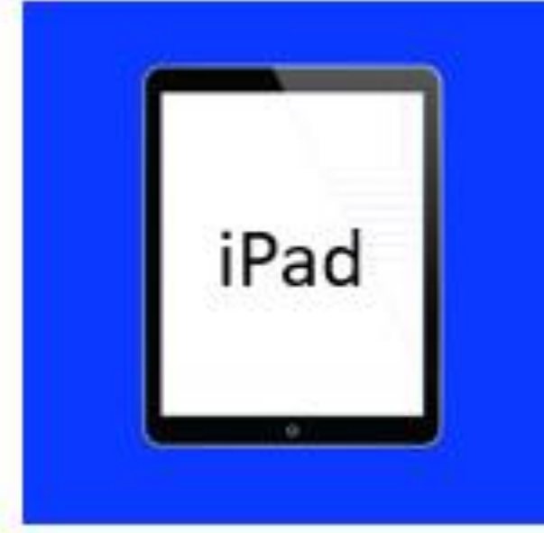
iPads for police and school resource officers