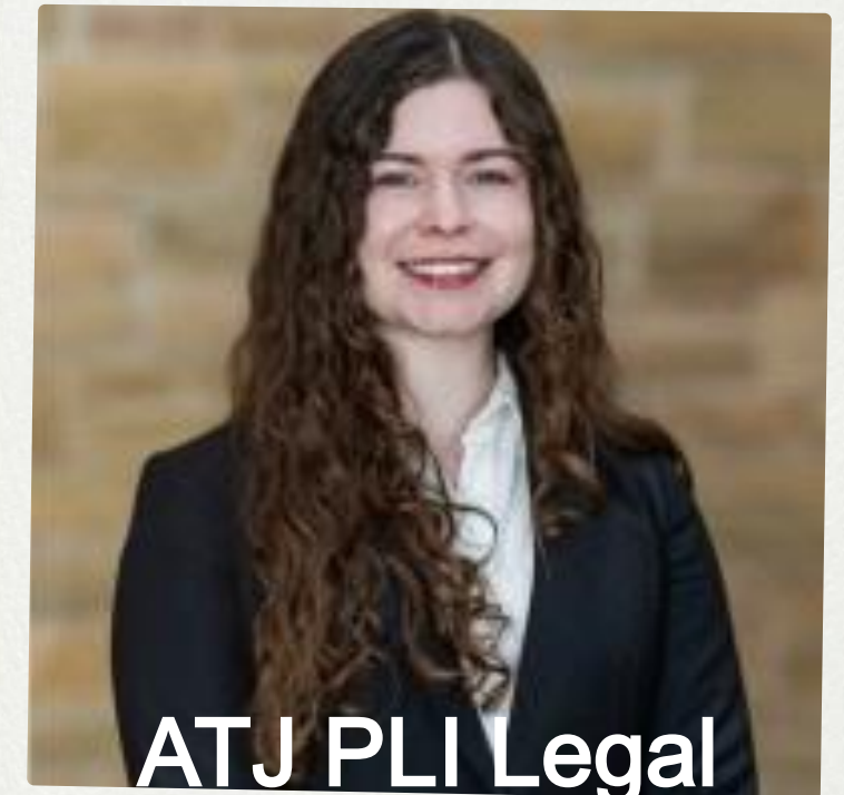
ATJ PLI Legal Intern