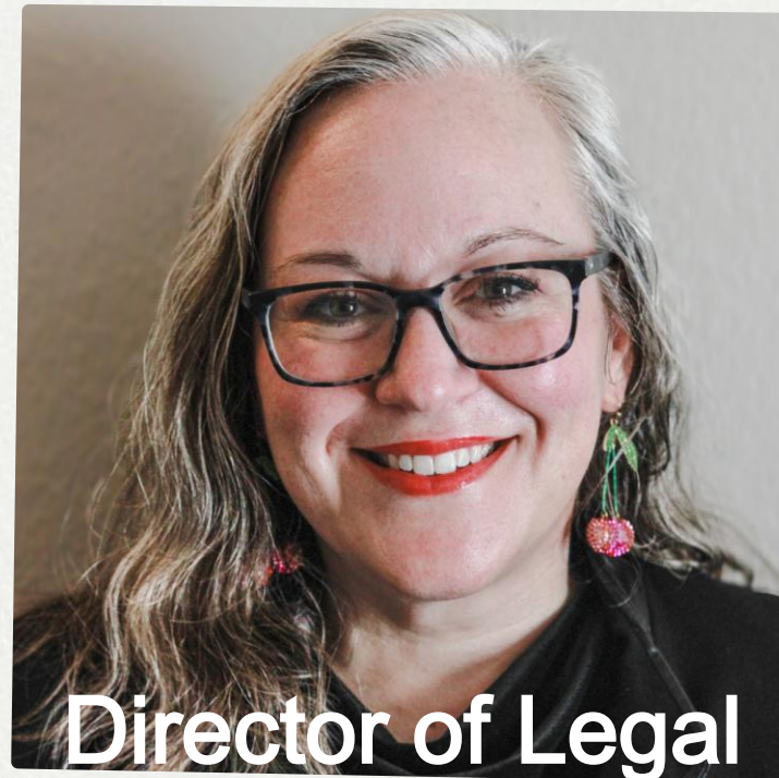
Director of Legal Innovation